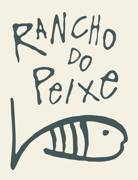
Preá – Ceará